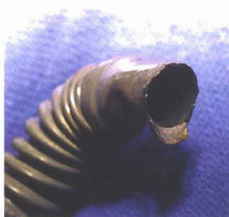
Photo 2. End of flexible gas line with most of the flare having melted due to electrical activity.

A photomicrograph of the hacksaw mark is shown in Photo 1, while the flared end of the gas line to the water heater is shown in Photo 2. The hacksaw mark is actually a