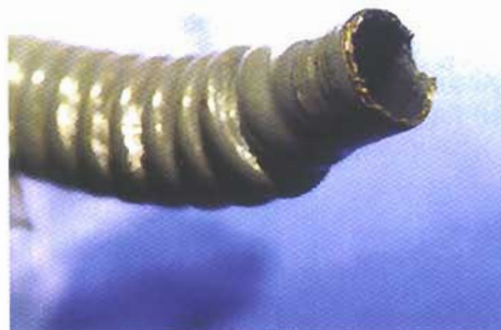
Photo 4. Side view of gal line in Photo 3, with the polymer coating still relatively intact because of protection provided by the brass nut.

Examination of the meter base showed extensive melting of metal where one of the hot leads from the service drop had contacted it. This shorting and arcing was the cause of the fire at this location. The damage caused by the limbs had pulled the neutral off of the meter base, and the voltage now applied to the meter base by one of the hot leads energized the ground system in the residence. This ground system included the water heater and its gas line. The flex gas line and its flared end are shown in Photo 3; as before, the electrical erosion of the flared end is extensive. Examination of the house showed that it did not have a cold water ground or ground rod; thus, the gas line served as the grounding system.