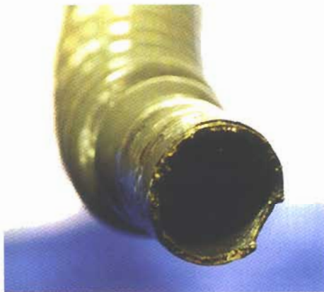
Photo 3. End of gas line with flare being destroyed by electrical activity.

This fire occurred in a heater closet in a residence. The fire was thought to have possible occurred because of some type tampering with the gas lines. The fire originated at a leak in the gas line at the point where the flexible gas line attached to the furnace. Photo 3 shows the end of the flared gas line, it shows almost complete erosion of the flare.